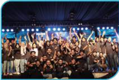
AUDACIOUS NATIONAL LEVEL MANAGEMENT FEST

Here learning is blended with fun where a number of extra-curricular activities starting from sports to cultural events are being celebrated. Students are inspired to participate in these activities in line with their interests. These events are managed by the students themselves giving them the chance to possess active expertise in handling such events.