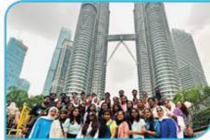
MALAYSIA FREE INTERNATIONAL INDUSTRIAL VISIT