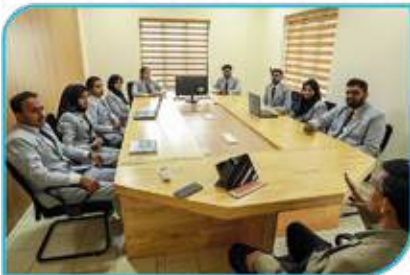
ED CLUB LEADERS MEETING