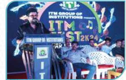
ITM FEST 2K24 INAUGURATED BY NADIR SHAH- FILM ARTIST