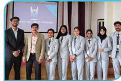
WORKSHOP ON EFFECTIVE PUBLIC SPEAKING