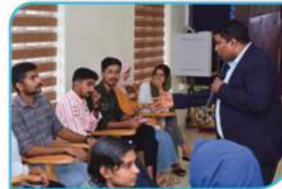
RESIDENTIAL TRAINING PROGRAMME