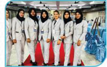
STUDENTS AT INTERNATIONAL EDUCATIONAL EXPO